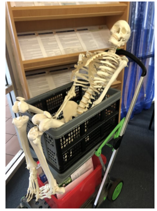
A little nap before work...

We engaged with many, many people, some of whom had not known of our existence until then! More than 140 people stopped at our stand for a chat and / or to collect materials.